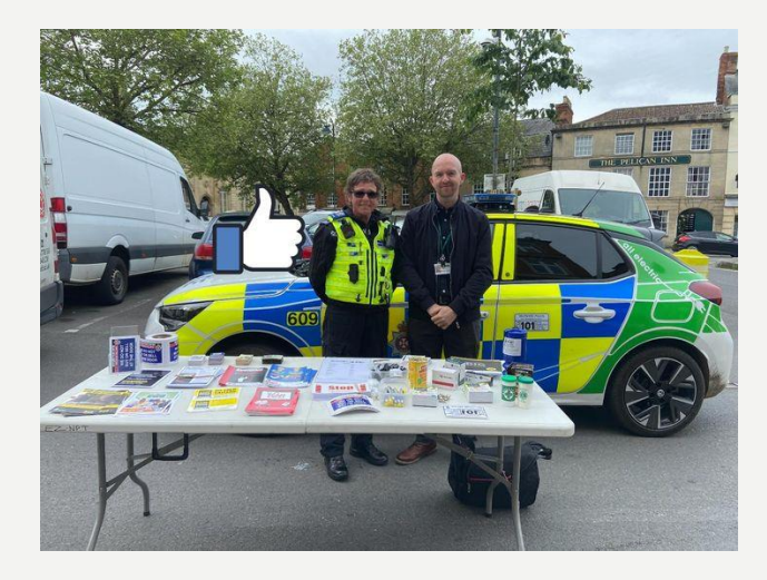
Visibility with partners/trading standardscrime prevention advice